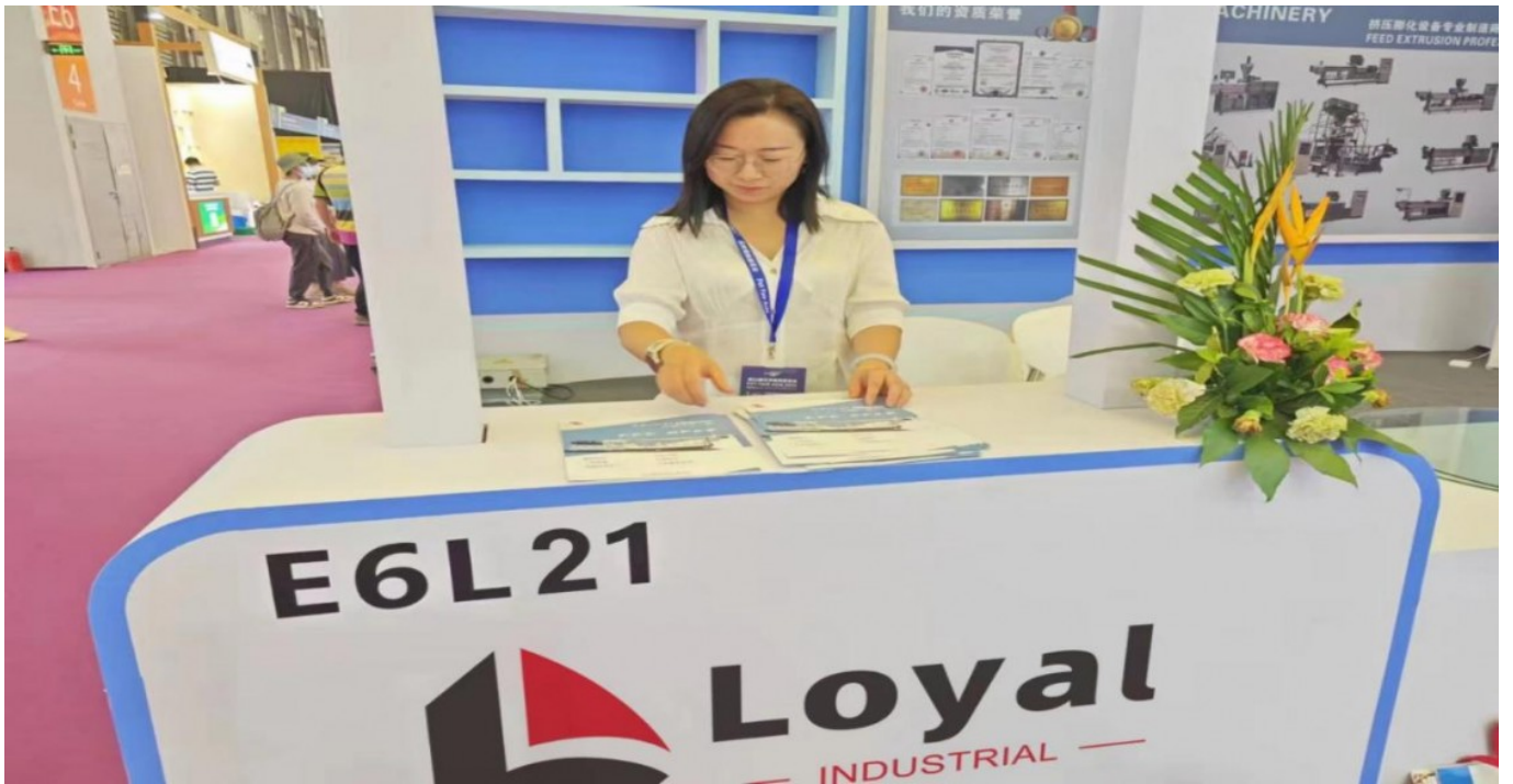
Company Booth Display