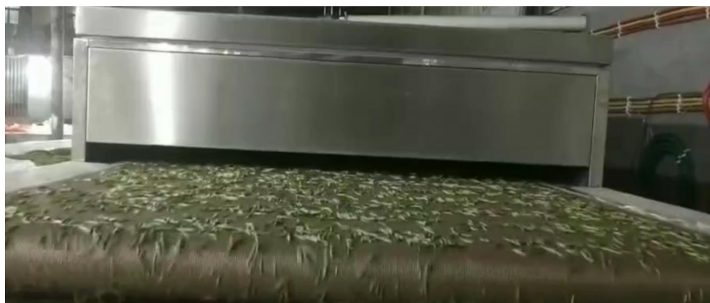
herbs leaves tea sample of Industrial belt type microwave drying machine For processing