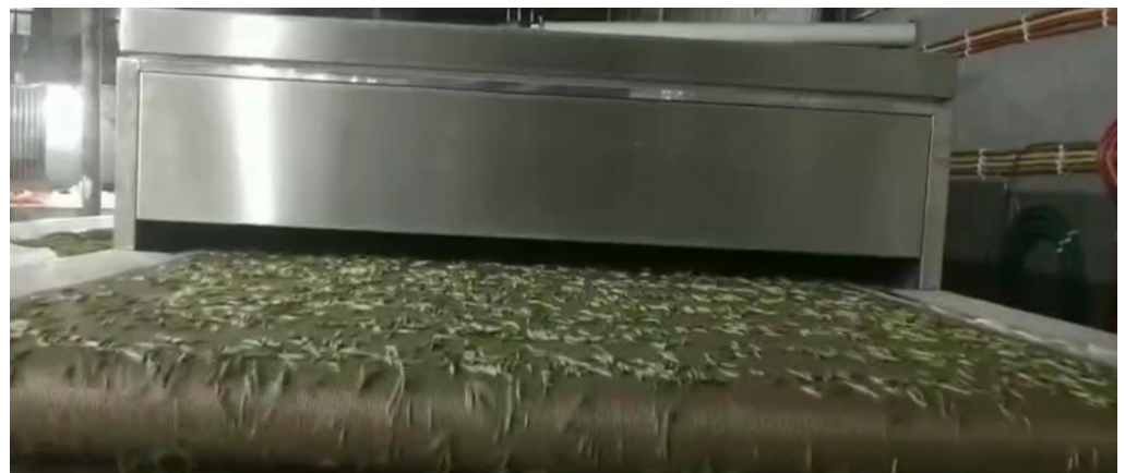
herbs leaves tea sample of Industrial belt type microwave drying machine For processing