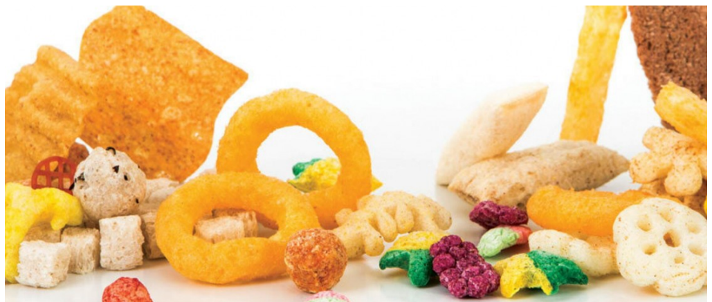
sample of Microwave Bake Puffing Equipment processing

My reply: The appearance and color of the products baked by the microwave baking equipment remain unchanged, the particles are puffed and full, the taste is crisp, and it has the functions of killing insects and sterilizing.