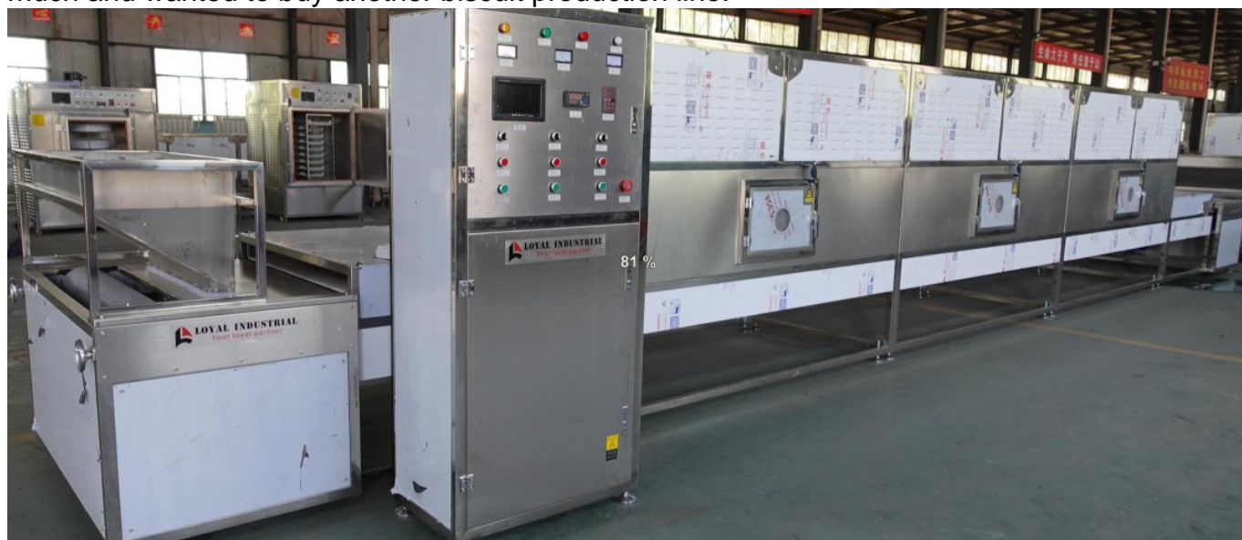
300kg/h Raisins Microwave Bake Puffing Equipment in workshop

Customers are very positive about orders. Proactively communicate with me about payment methods, incoterms, etc. After receiving the customer's deposit, our production department starts to produce the machine for the customer. The customer recognized our company very much and wanted to buy another biscuit production line.