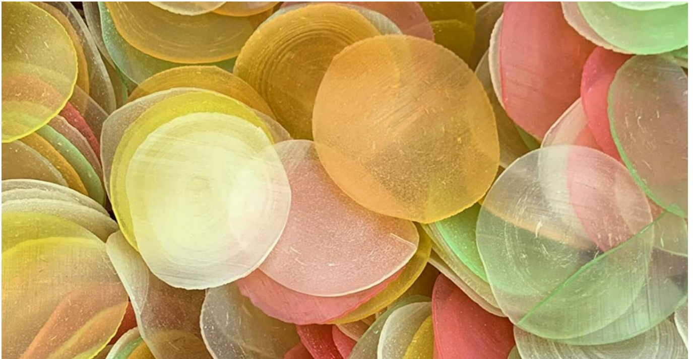
Sample of Colorful Shrimp Chips Pudding

He owns a puffed food production factory and produces puffed shrimp chips. He now needs drying equipment to dry puffed shrimp chips because he heard that this will make the product better. So I recommended our 100kg/h Microwave Colorful Shrimp Chips Pudding Machine to Tayeb, because puffed shrimp chips have colorful colors, we need to ensure their color and taste when drying them, microwave drying equipment will be the best choice.