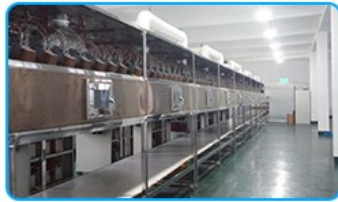
Toshiba Water-cooled Magnetron