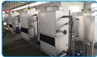
Closed cooling tower