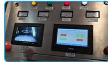
PLC control system