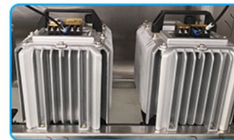
Microwave power supply

I ask the Indonesia customer is the purpose of drying this grasshopper larvae for pharmaceutical purposes?