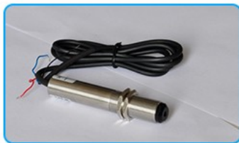
Raytek temperature controlled probe