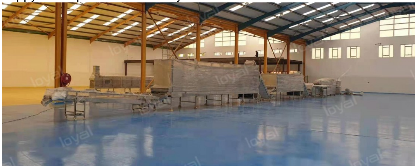
300 kg/h Automatic pet food processing equipment in Argentina's customer factory

When the Argentine customer was still a little hesitant, I provided him with more detailed information. He didn't have to worry about the motor and other parameters. Finally, we sold a 300kg/h pet food production line. The shipping period is about 30 days, and soon he received our machine, which is now in normal production. He said that he is very happy to cooperate with our loyal.