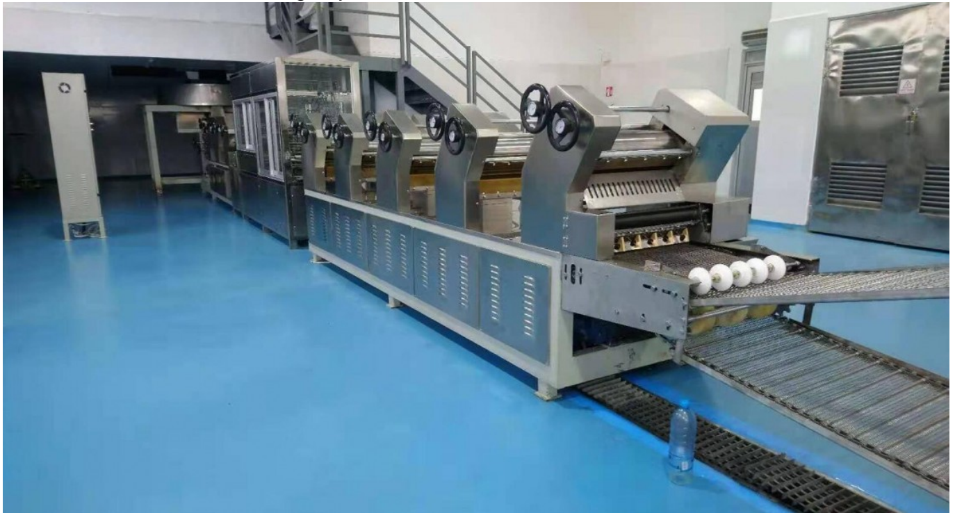
CE Approved Industrial Automatic Extruder Protein Bar Production Line in Algeria Customer workshop