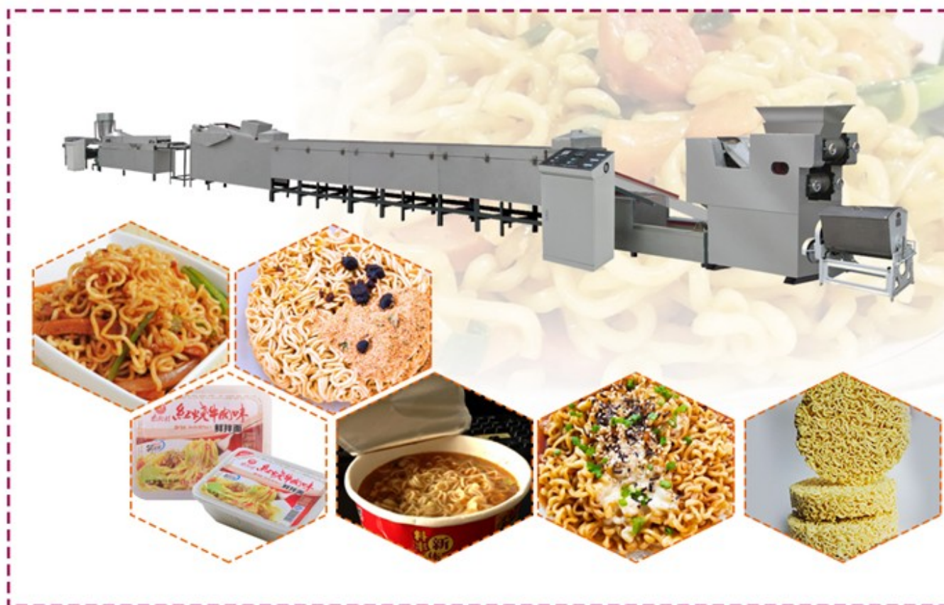
Commercial instant noodles making processing line

Automatic instant noodle production line was consisted of dough maker, forming host, steam noodle machine, cutting machine, frying machine and cooler. It is on the basis of the research of similar products at home and abroad, combined with the needs of the mass consumer market in China. With miniaturization the production features a new generation of products developed and manufactured by its technology to improve, compact design novel, stable and reliable performance. The automatic instant noodles production line from flour to finished product once complete, the high degree of automation, simple operation, moderate, production, energy saving, small footprint, the investment is only one tenth of the large-scale equipment, with less investment and quick. Special suitable for small and medium-sized enterprises.